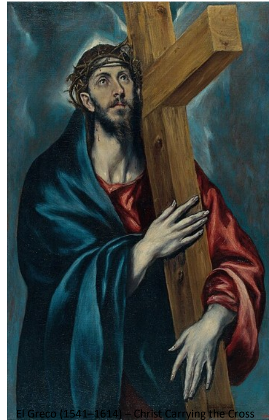
El Greco (1541–1614) – Christ Carrying the Cross