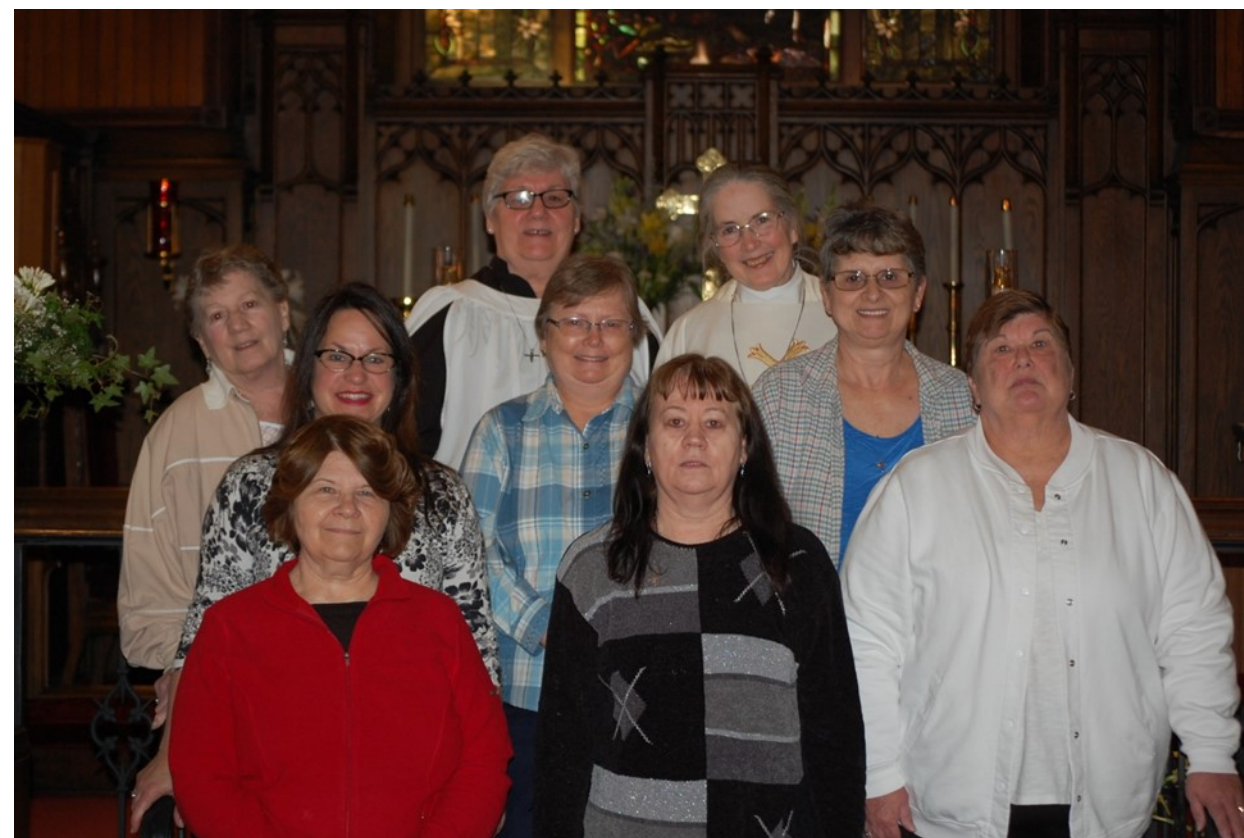
The St. Philip's Chapter of the Order of the Daughters of the King St. Philip's Episcopal Church, Norwood, NY Province II, Albany, NY Diocese

The St. Philip's Chapter of the Order of the Daughters of the King received seven new members at a Service of Admission on Sunday, April 23, 2017 – Thomas Sunday.