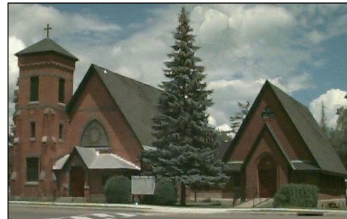
St. Philip's Church